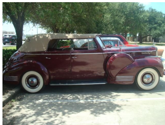
Leon Ahlers 1941 Convertible Sedan