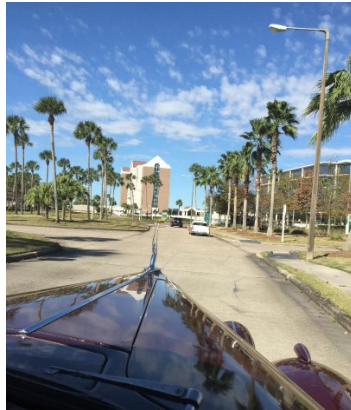
Baccaro's hood ornament