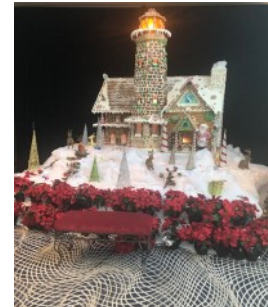
Huge 2019 Gingerbread House in Hotel Lobby