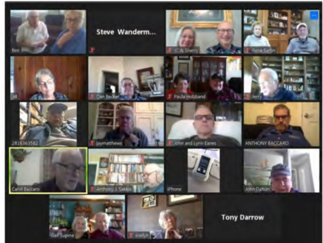
Attendees at Saturday, Feb. 20 LSP Zoom Meeting

A smile is an inexpensive way to change your looks!