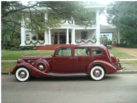
1937 Packard Limousine