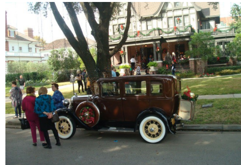
1930 Model A