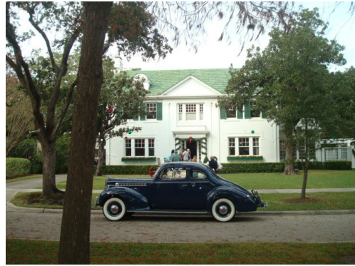
1940 Packard 110 Coupe

We had a great Sunday afternoon enjoying the tour and being a part of this Houston Historic Preservation Society event.