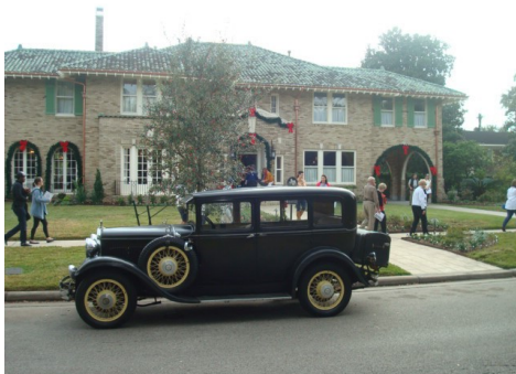
1930 Dodge Brothers Sedan