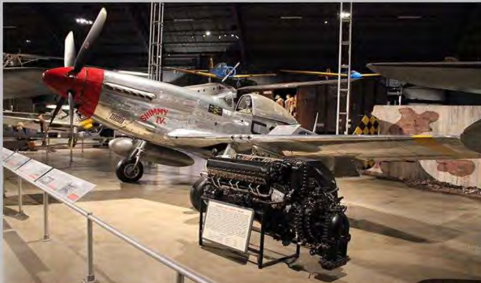
This photo shows the Packard built Merlin on display next to its most famous American application, the North American P-51 Mustang.