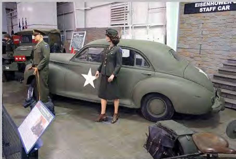
This 1942 Packard was built before the government ended production of civilian production of automobiles in February 1942. From the collection at the National Military Historical Center, Auburn, IN.

*There is no mention of Packard building any boat reversing gears of any type during World War Two. Only the marine and aircraft engines are documented. However, I have found as shown in the Marine Engine section of this page two Packard-built Snow and Petrelli Joe's Gears Reversing Gears on Packard 4M2500 engines. The highest of the two serial numbers on the Packard data plate is 4597. Assuming production started with serial number 0001 Packard built at least 4,597 of these gear boxes.