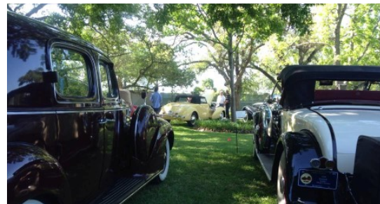
Under the trees at Lakewood Yacht Club