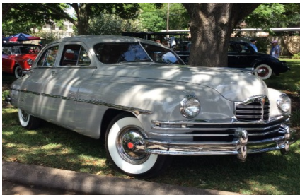
Dan Grilli's '48 Super 8 - Best in Class!