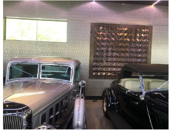
The automobiles were displayed beautifully, and the art work was superior!