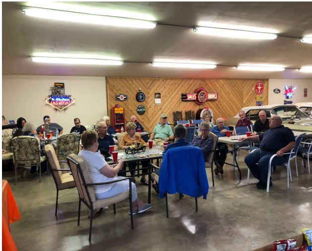
Group at Saturday's Meeting