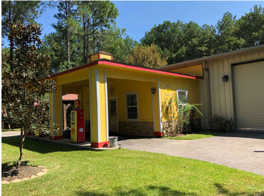
Front of Jack's car barn