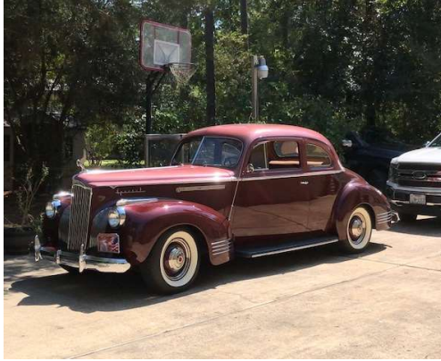
Bill's 1941 Coupe Special