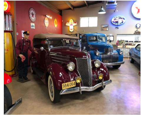
More of Sartin's cars