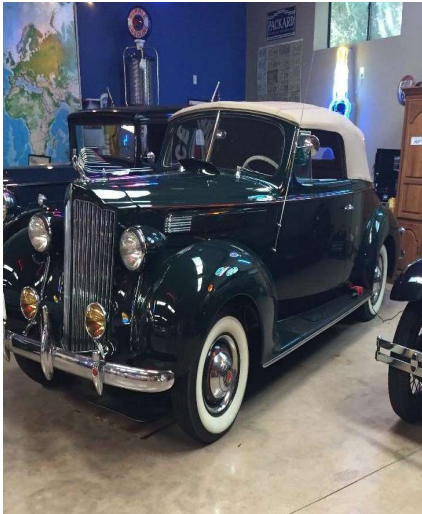
Jack's '37 Packard Convertible