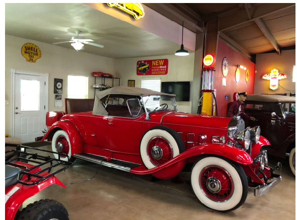
Classic Cadillac in Jack's Collection